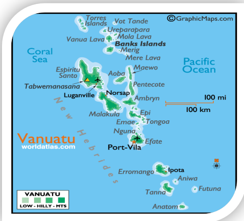
Vanuatu Islands Location (Courtesy of tourismvanuatu.com)

diver tucks his head between his shoulders, and since this is done with no protection the diver is exposing himself to fatal injuries or even death.